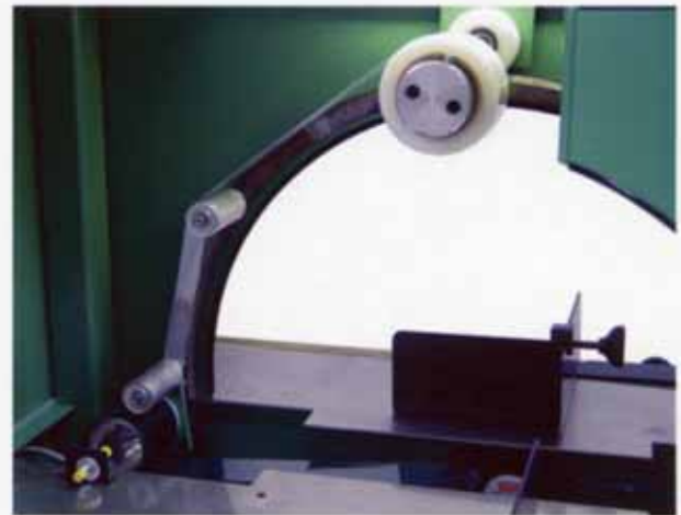
Quick access for changing film rolls or adjusting film stretch.