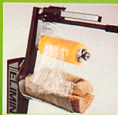
Many options are available such as the custom cradle for bundling cylindrical products (as shown)

The Eliminator accepts all standard handwrap and machine films. Your film choices are not limited to costly re-rolled films on non-standard core sizes.