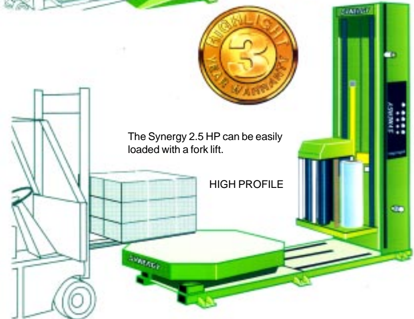
The Synergy 2.5 HP can be easily loaded with a fork lift.