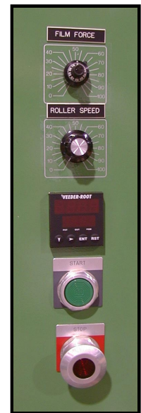
The Control Panel makes using the Synergy Roll Wrapper for Small Applications a breeze!

In addition to the machine shown, Highlight custom designs spiral overhead, horizontal and face roll wrapping machines. Highlight Industries is also a leader in the semi-automatic / automatic pallet wrap and stretch bundling machine industry.